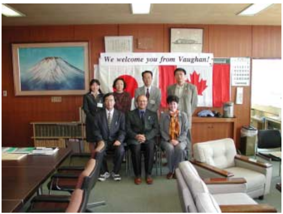
Vaughan delegation in Daisan Junior High School, Sanjo, Japan