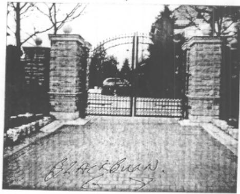
Blackburn. 159 Blackburn Blvd. C.N. 10' gate. 21-11-01