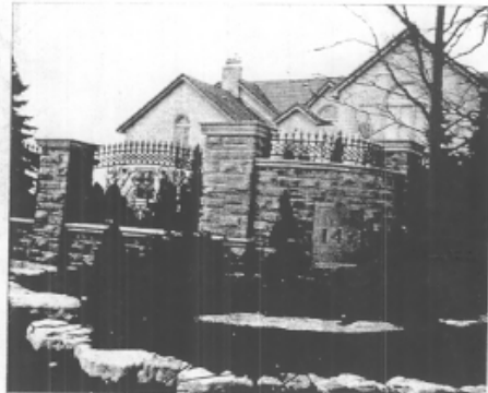
147 Blackburn Blvd. C.N. 8' section near gates 21-11-01