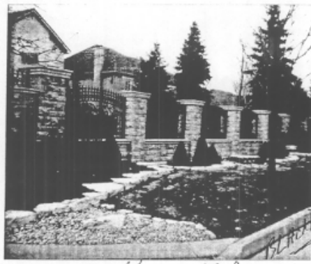
159 Blackburn Blvd. C.N. 7' fence