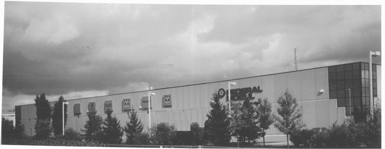
WEST ELEVATION 336 COURTHAND AVE