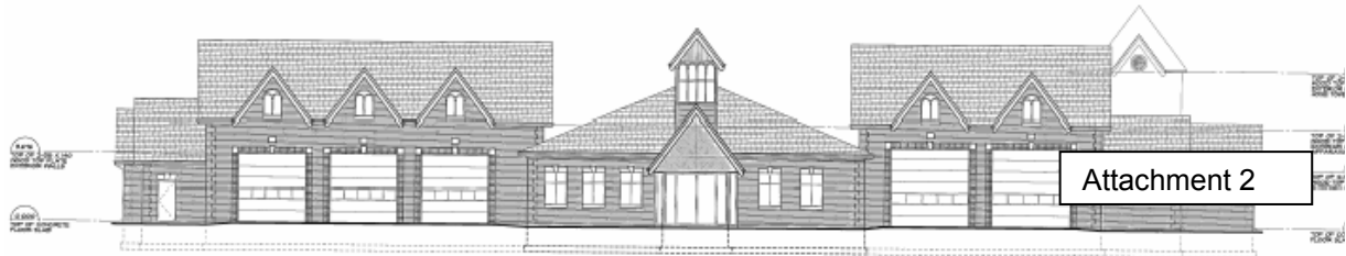
York EMS Paramedic Response Station and VFRS Fire Station 7-8 111 Racco Parkway