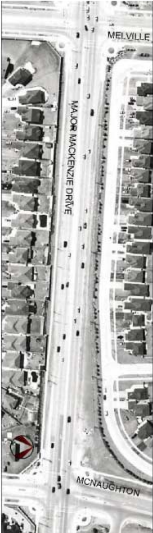
MAJOR MACKENZIE DRIVE EXISTING CONDITION - 5 LANE REGIONAL ROAD SECTION