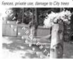
Fences, private use, damage to City trees