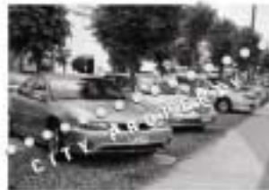
Retail parking damages grass and tree roots by compacting the soil, and reduces the City's ability to perform regular maintenance