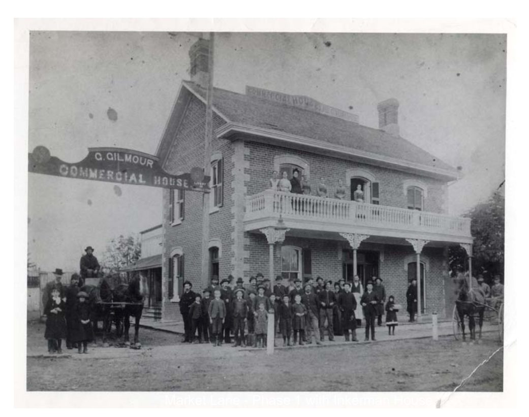
124 Woodbridge Avenue as "Gilmour Commercial House" c. 1880s