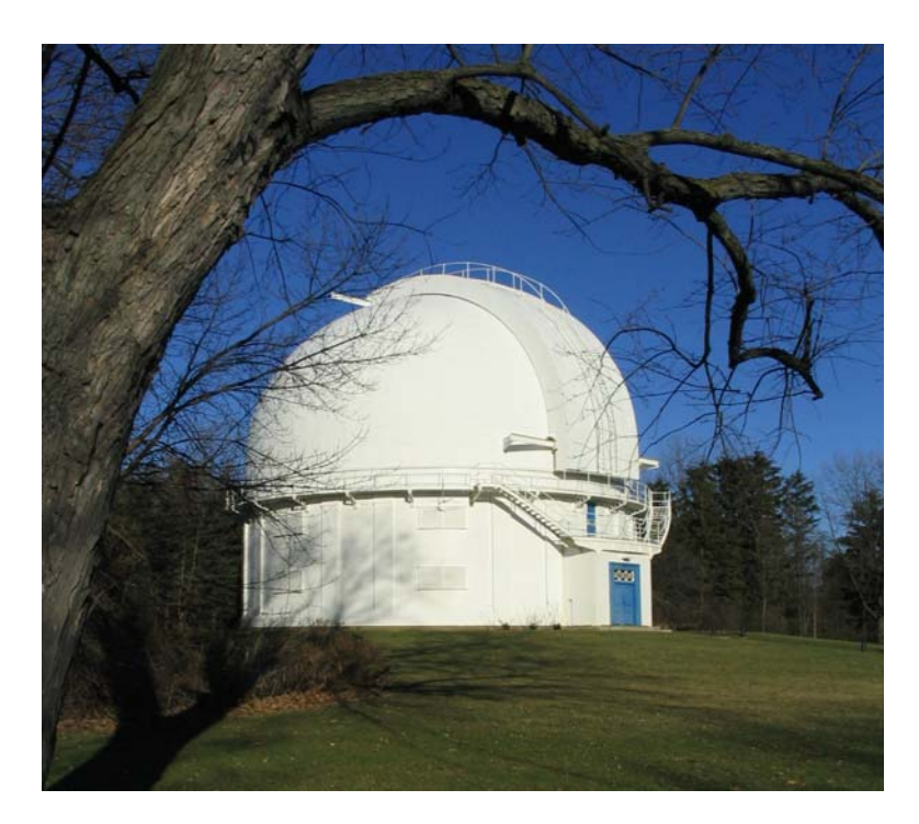
Figure 1. David Dunlap Observatory main building, with a 74-inch telescope built in 1935.