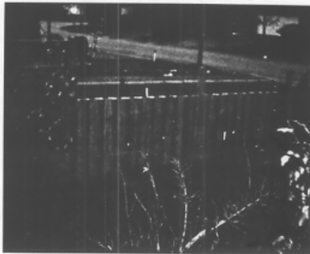
11 LEITH CRT - VIEW FROM PORCH #15 LEITH CRT.