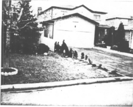
11 LEITH CRT - S/E VIEW FROM RD