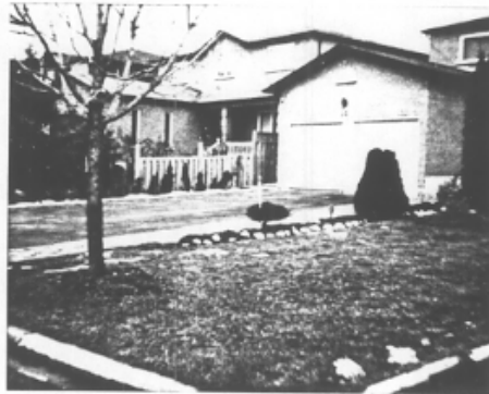
11 LEITH CRT - N/E VIEW FROM RD