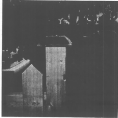
74 HAMMORSTONE CRES.