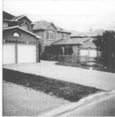
74 HAMMORSTONE CRES.