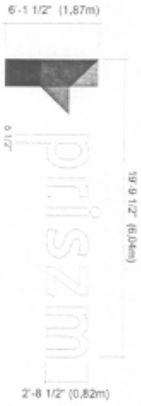
FROM VIEW - CHANNELS SCALE 3/4\"/>

DESCRIPTION: Channel Letter LOCATION: 1125 W. UNIVERSITY AVE. TORONTO, ONTARIO AREA: 121 K2 or 11.26m 2