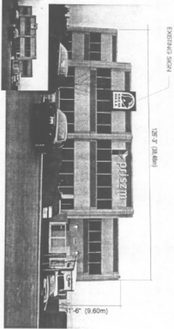
North Elevation Not Scale