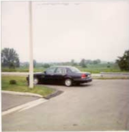
PAS 124 Aug 2013