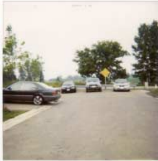
Abdus Salem Aug 2013