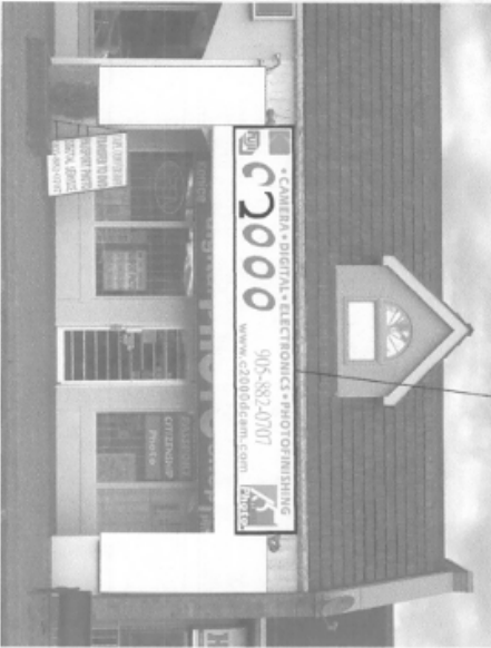
LIGHT BOX #1