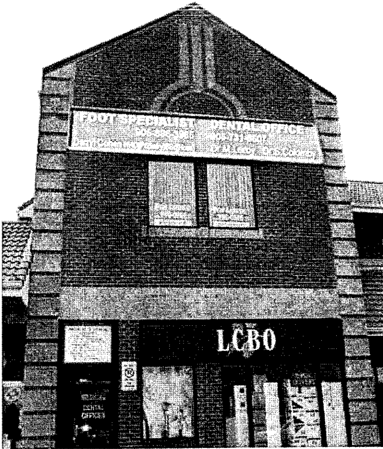
3' x 12' s/s aluminum sign box illuminated with fluorescent lamps

Customer: Runnymede Development Corporation Address: Springfarm Plaza - Hilda & Clarke Date: September 15, 2005 Scale: 1/2" = 1'-0" Account Executive: George Drawing #: 05-889 Page _____ of _____